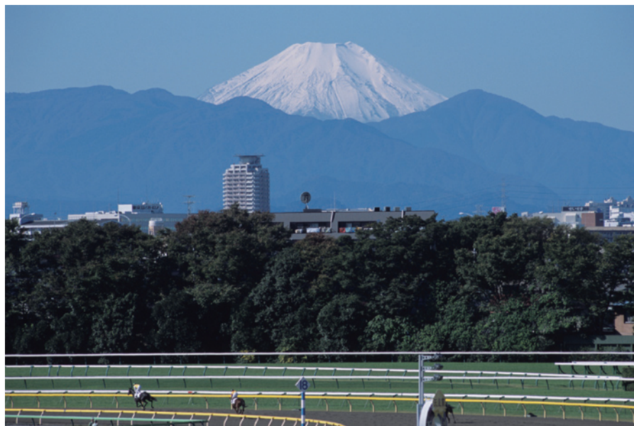
Mt. Fuji that can be seen from Tokyo Racecourse.

A day out at each racecourse is an experience in itself. Each track is different, as is the atmosphere. From the huge crowds on Grade 1 racedays in Tokyo