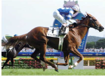
2008 JRA Best Three-Year-Old Colt, Deep Sky

growth of wagering and attendance was the Emperor's Cup (Autumn G1) on November the 2nd. At this race, two very popular two racehorses had a historic battle, which is now called the "race of decade." It took 15 minutes to decide the winner, because of the very close finish between Vodka and Daiwa Scarlet, both of which are mares born in 2004. The finishing photo showed that Vodka, who had previously won three G1 class races including the Japanese Derby, had beaten Daiwa Scarlet, previous winner of three G1 class races. Daiwa Scarlet would eventually go on to capture the Arima Kinen (G1) in December, again by a "hair." Since this race, we have seen more coverage of racing featured in non-racing major publications and on popular TV shows and it is believed that the dramatic performance in that Emperor's Cup race has spiked the interest of editors and directors to feature more horseracing coverage in their publications and programs.