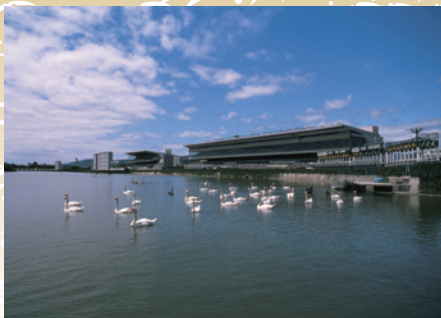
Kyoto Racecourse featuring a beautiful pond in the infield.