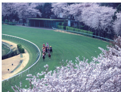
Horse racing with cherry blossoms in full bloom.

(and Nakayama), to the picturesque Kyoto and Hanshin courses (beautiful in cherry blossom season), and the laid back atmosphere of summer racing at Kokura – each racecourse has its own charming features.