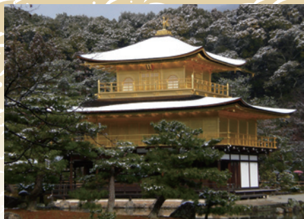
Kinkakuji that represents the old city Kyoto.

scribed them as “more sand than dirt.” The times on dirt are much slower than on turf, but that can change when the track is wet. It is easier to run on wet sand than it is on dry sand!