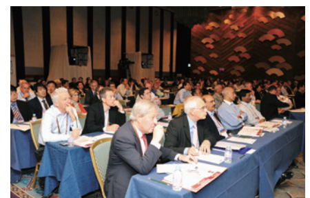
Asian Racing Conference (ARC)

2009 should be a year where racing fans of the world will more than ever, have chances to see challengers from Japan running in international races in their own hometowns.