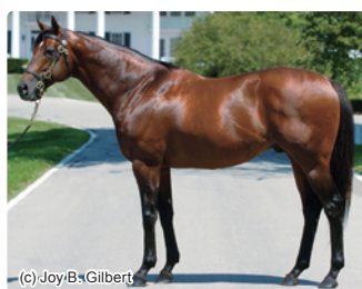
Aldebaran (USA), 1998, bay

We have compiled a table of information about new stallions for 2009, which includes their pedigrees and where they are slated to stand. Four of the stallions are identified as follows: