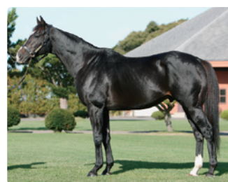
Black Tide (JPN), 2001, dark bay