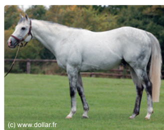
Chichicastenango (FR), 1998, gray