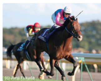
Meisho Samson (JPN), 2003, bay