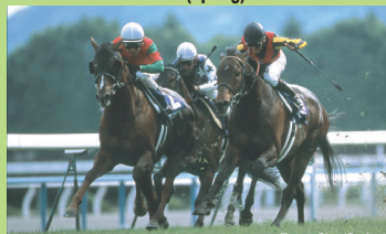
Tenno Sho (Spring)